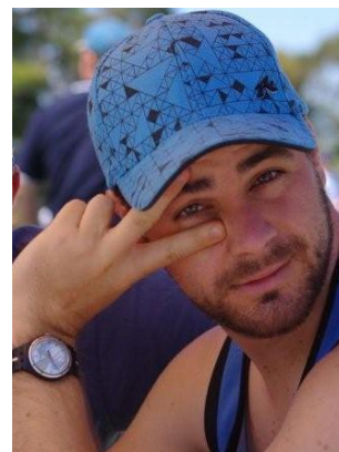
me a star (but to a lesser extent)