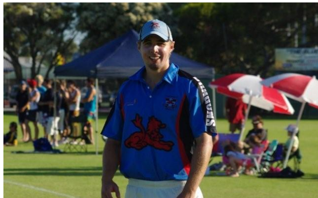
Bleached for 2009

THE THOUGHT - If a man who cannot count finds a four-leaf clover, is he lucky?